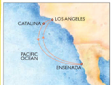
4 Day Baja Mexico